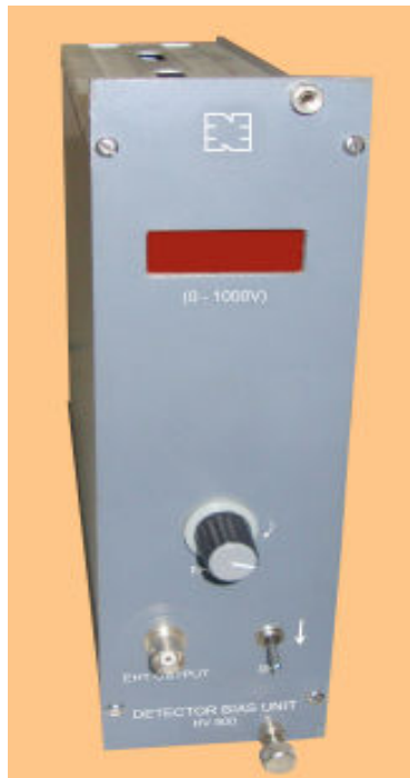
TYPE : HV500